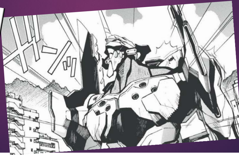
Panels from Neon Genesis Evangelion (1994–2013)